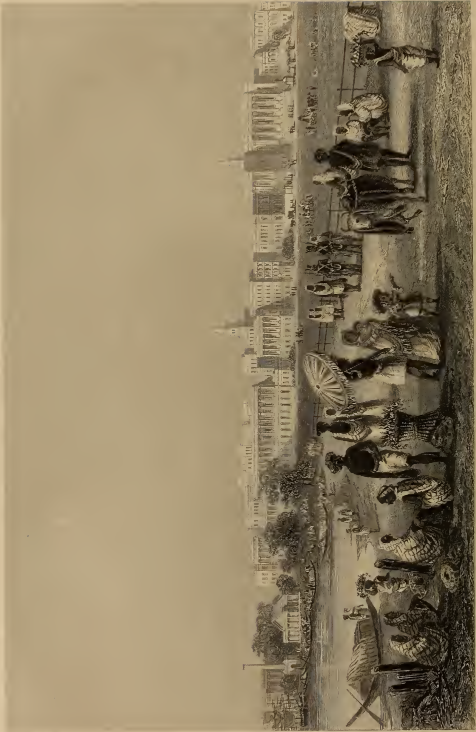
VIEW OF THE HARBOUR OF BOSTON FROM THE WATER