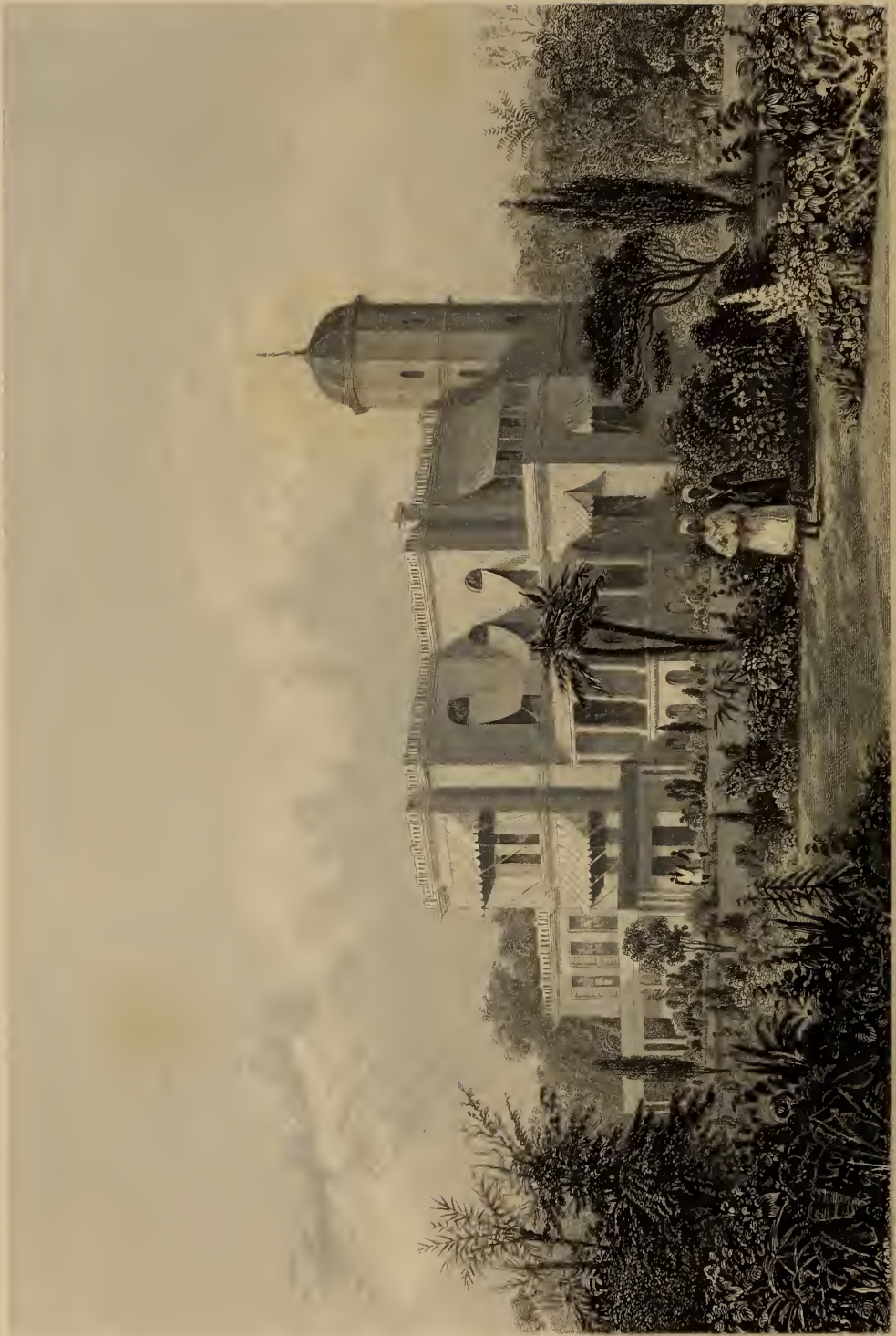
THE GREAT MOSQUE, CAIRO, EGYPT