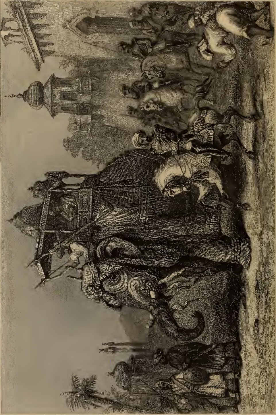
THE NANA'S PALANQUIN AT THE COURT OF THE KING OF BOMBAY