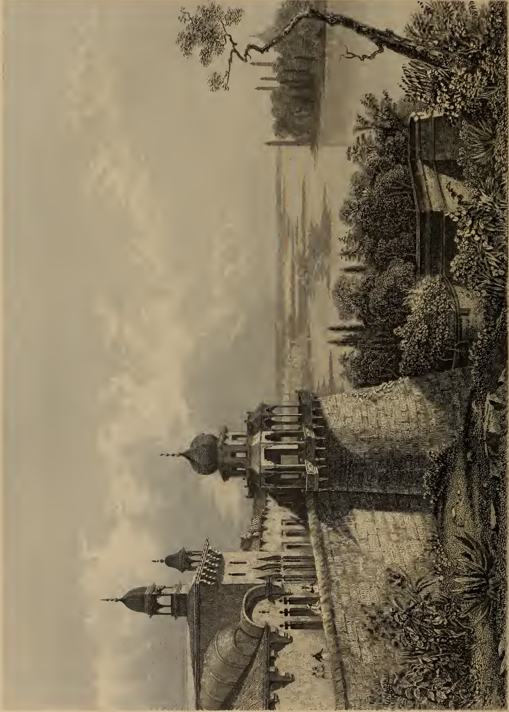
THE GREAT BRIDGE OF THE TIBET