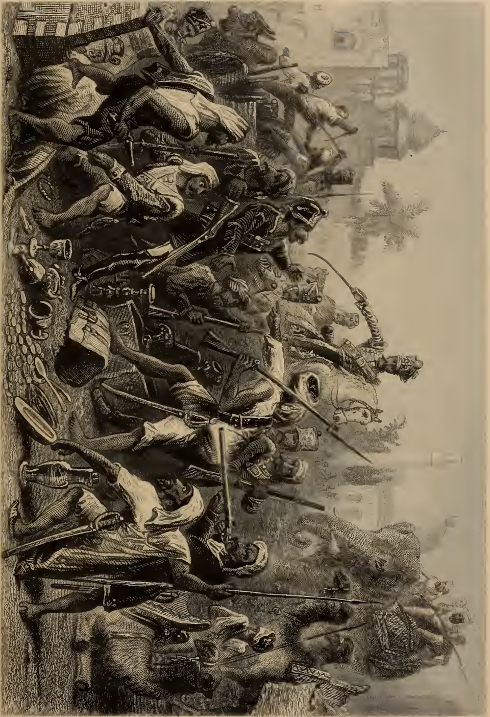
THE BATTLE OF ...