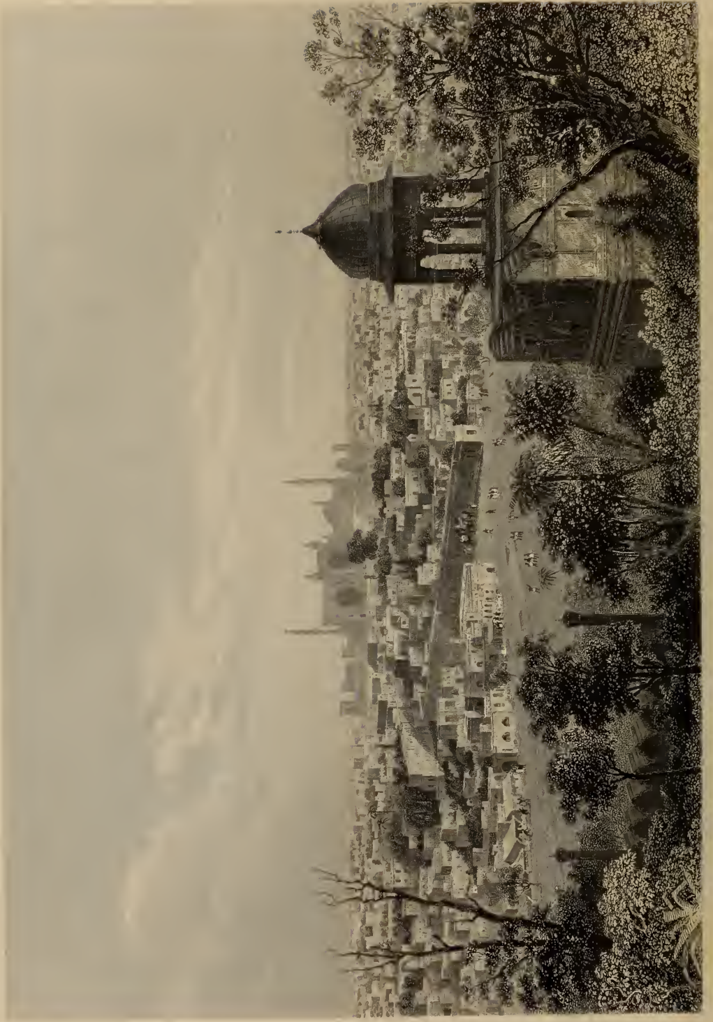
VIEW OF CAIRO FROM THE PALACE OF THE