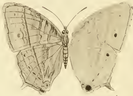
Fig 107. CYRESTIS COCLES, Fabricius. ♂