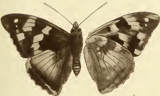
Fig. 88. DILIPA MOROZIANA. Westwood.