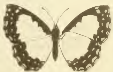
FIG. 119. STIBOGES NYMPHIDIA, Butler ♀