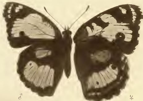
Fig. 94. JUNONIA CERONE. Linnæus