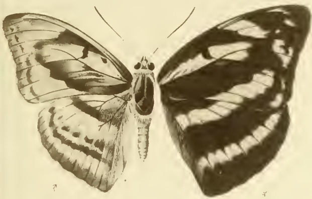
FIG. 110. APRISA MITTA, Fabricius