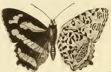
Fig 106. SYMBRENTIA ASTHALA, Moore. ♂