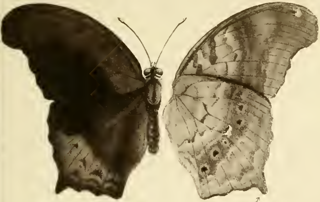
Fig 101. TERINOS CLARISSA, Boisduval. ♂