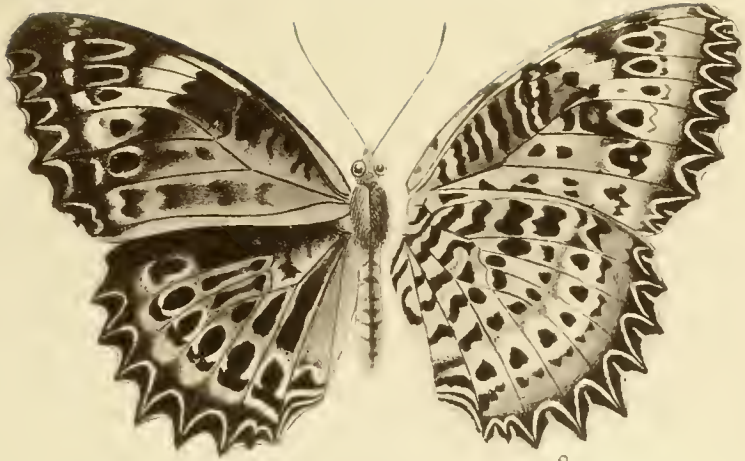
FIG. 98. CETHOSIA MAHRATTA, Moore ♀