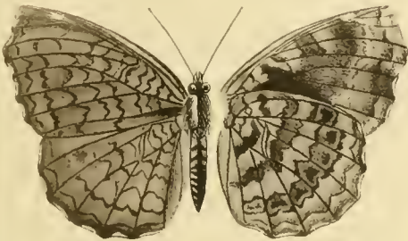
Fig. 70. ERGOLIS MERIONE , Cramer. ♂