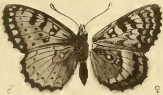
Fig. 72. MEGALOPUS BALBITA , Moore. ♀