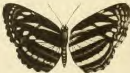
Fig 108. NEPTIS SOMA, Moore. ♂