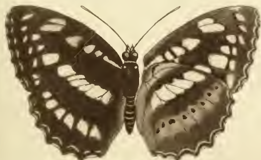
Fig. 89. ATEYMA FERUS. Linnæus