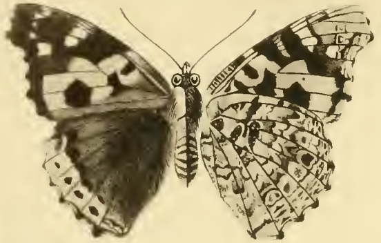
Fig. 71. PYRAMEIS INDICA , Herbst. ♀