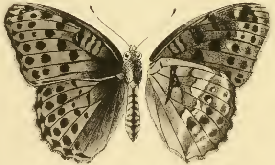
Fig. 75. ARGYNNIS RUPEA , Moore. ♂