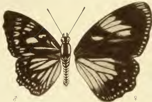
Fig. 90. ECRIPUS HALTHEKST. Doubleday, Hewitson