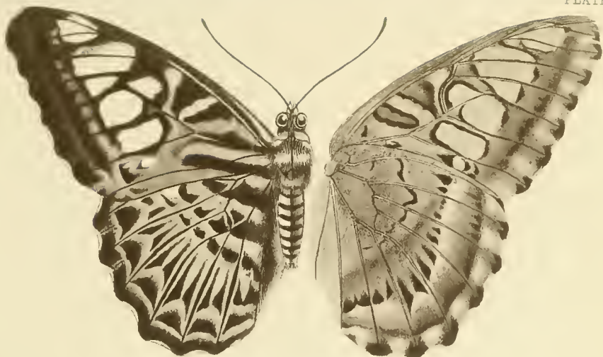
FIG. 95. PARTHENOS CYANEUS, MOC. ♂