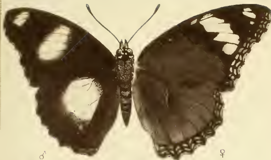
Fig. 85. YVELIMNIS M. S. LINNÆUS.