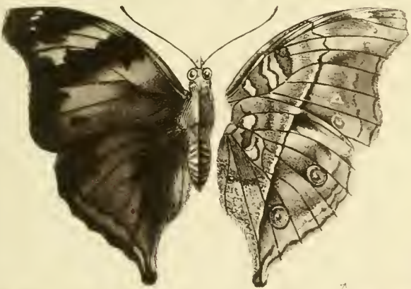
Fig 103. DOLESCHALLIA POLIBETE, Cramon. ♂