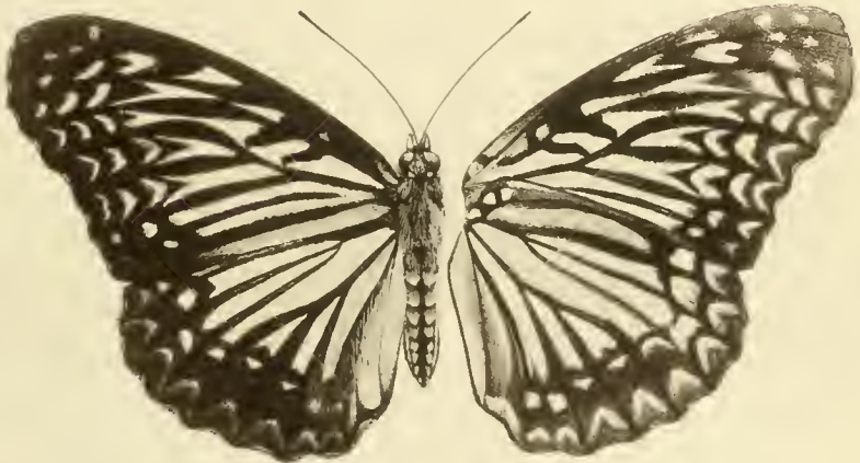
FIG. 99. HESTINA NAMA, Doubleday ♀