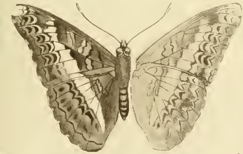
fig. 79. SABRA ISMENE, Guénée