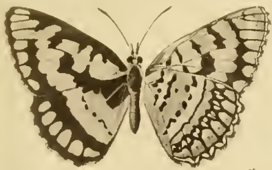
Fig. 68. BYOLIA ILITHIA Drury. ♂