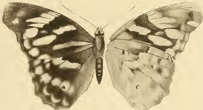
Fig. 76. HERGESA BROMANA , Moore. ♀