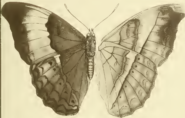
FIG. 111. CIRRHOCROA OTTOMANA, de Nicéville ♀