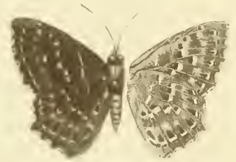
FIG. 111. ZEMERUS PLEOTAS Cramer ♂