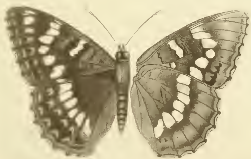
LIMENITIS HYDASI Moore ♂