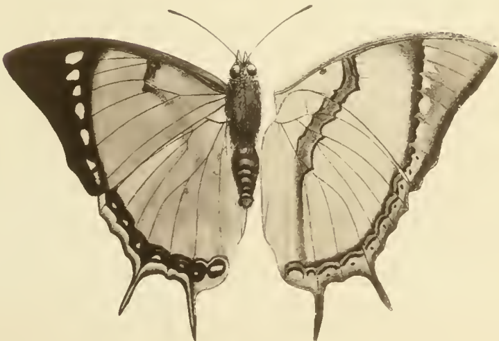
FIG. 100. CHARAXES DOLON, Westwood ♂