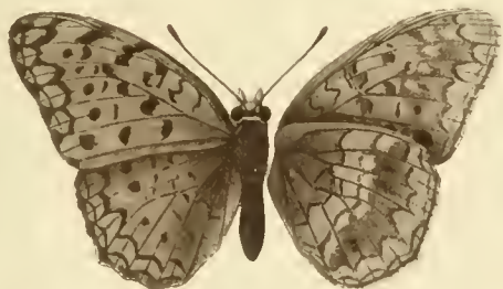
Fig. 63. ATELLA PHEALANTA. Drury.