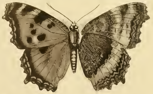
Fig. 73. VANESSA XANTHOM CAS. Nod. Vols. ♂