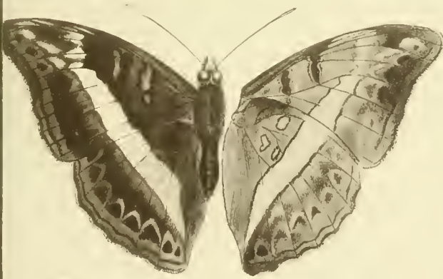
FIG. 112. LIMENITIS DUDU, Westwood ♂