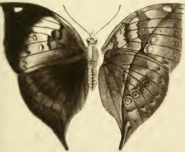
Fig 104. KALLIMA WARDI, Moore. ♀