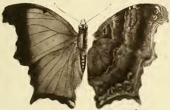
Fig. 102. RHINOPALPA EGIVA, Felder. ♂