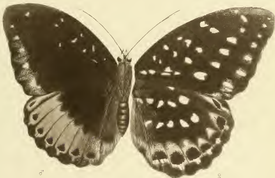
FIG. 96. SYMPHEDRA CYANIPARDUS, Butler ♂