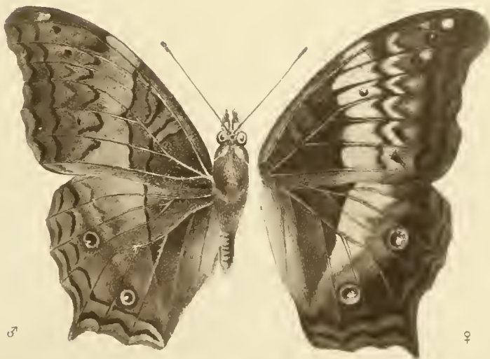
FIG. 97. CYNTHIA EROTA, Fabricius. ♂