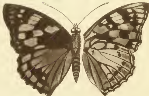
Fig. 93. SEPHISA DICHRQA. Kollar.