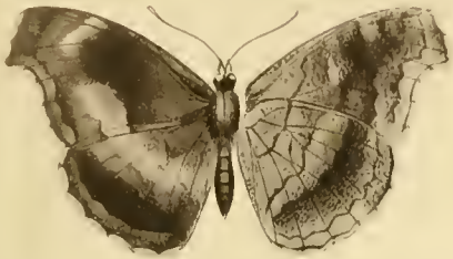
Fig. 69. EORTYLA BORSFIELDII , Boisduan. ♂