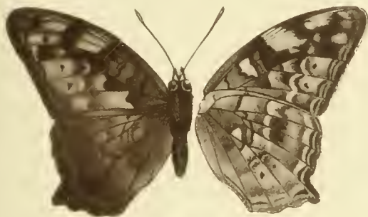
Fig. 87. ATELLA SINHA. Kollar.