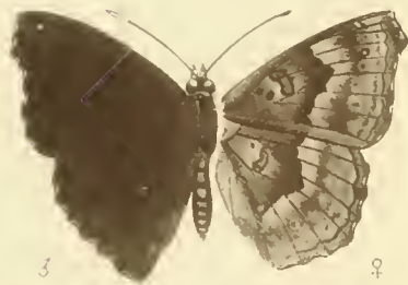
Fig. 92. APATURA TARYSALIS. Westwood.