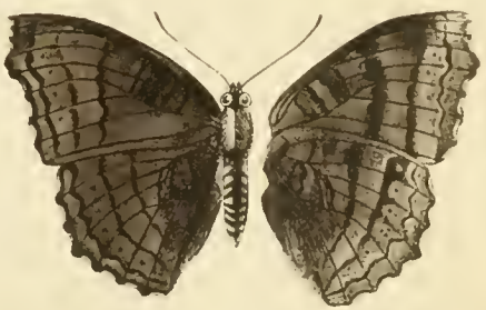
Fig 109. PSEUDOCOLIS WEDAR, Kollar. ♂