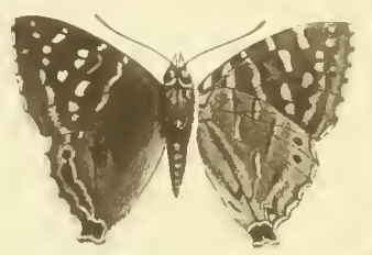
FIG. 116. DODONA DIPEA Hewitson.