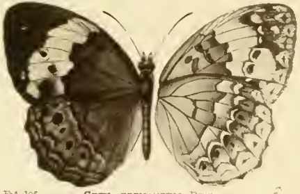
Fig 105. COPHA ERYMANTHIS, Drury. ♂