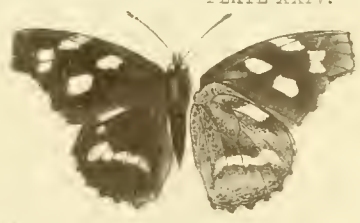
FIG. 109. LYTHEREA ROHINI, Marshall ♀