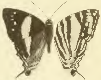
FIG. 115. DODONA LONGICAUDATA de Nicéville