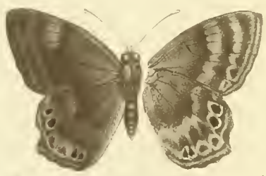
FIG. 113. ARISARA BIPUNCTATA, Moore ♀