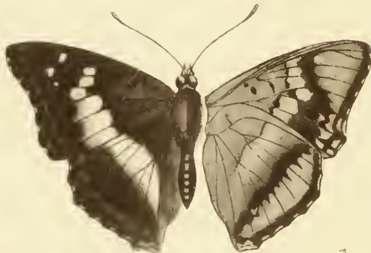
Fig. 91. APATURA NAMOUNA. Doubleday.