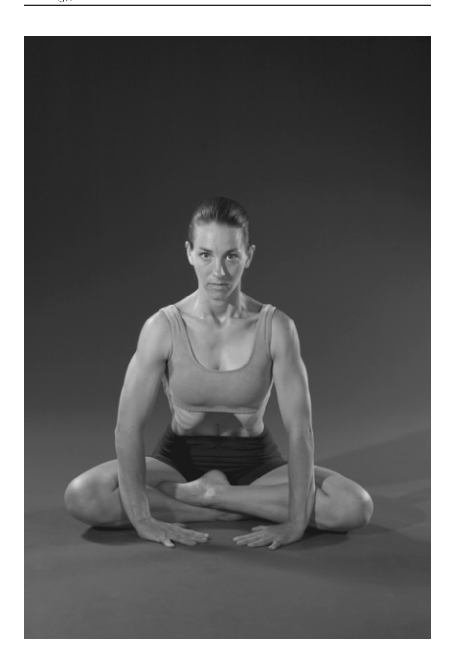
उड्डीयानबन्ध – Uddiyanabandha