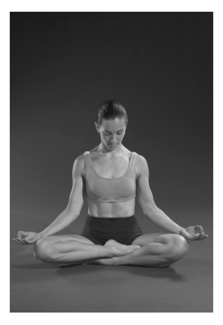
जालन्धरबन्ध & मूलबन्ध – Jalandharabandha & Mulabandha