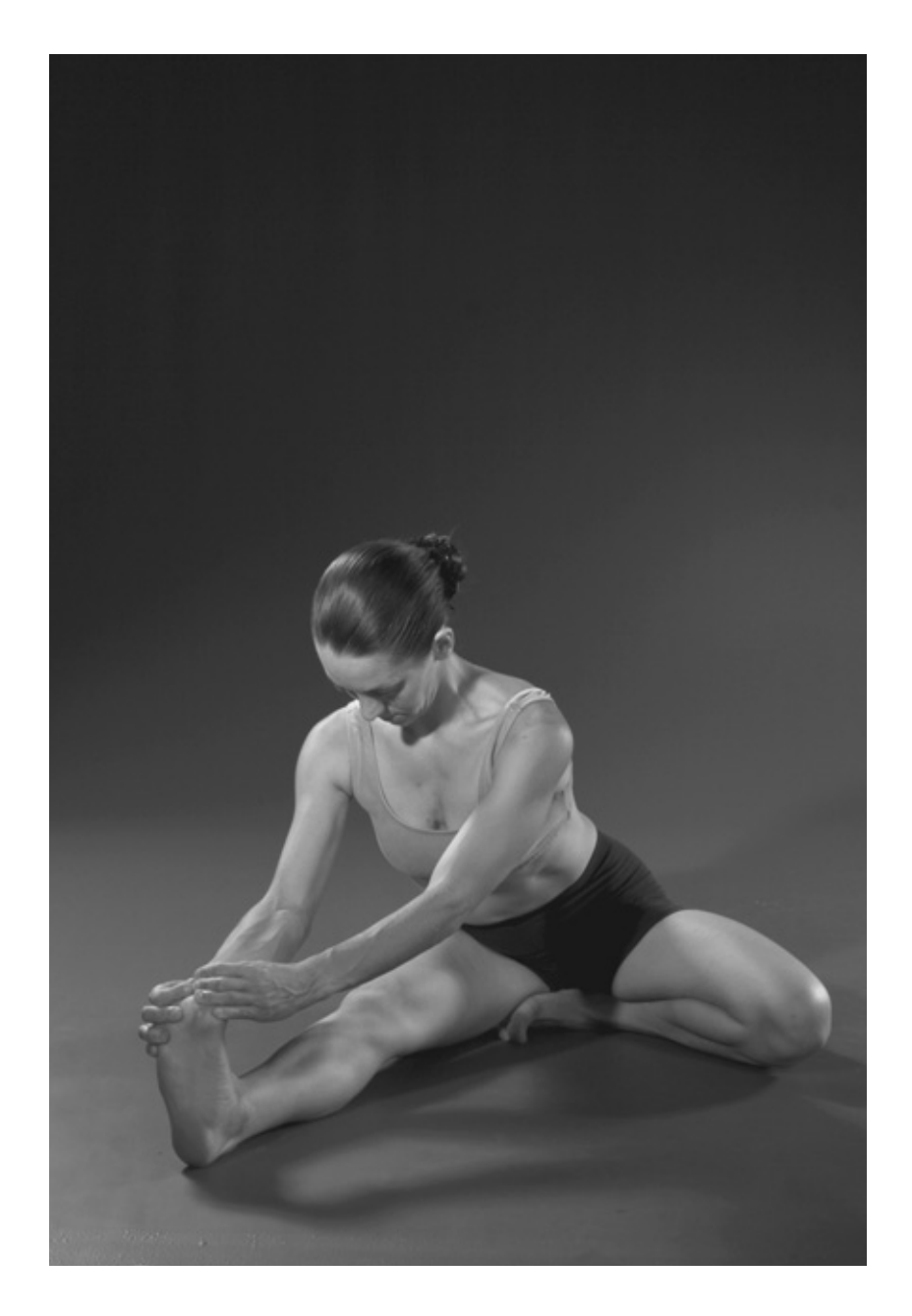
महामुद्रा – Mahamudra