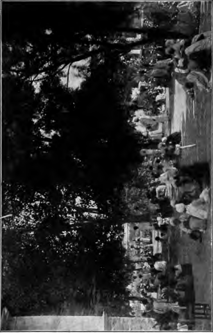
Sunday Bible Class, Medak