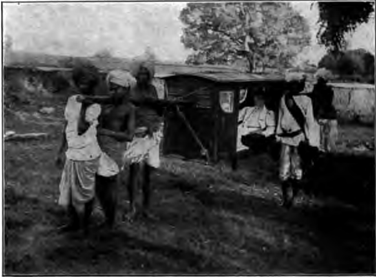
Medak nurse visiting the sick in a palanquin