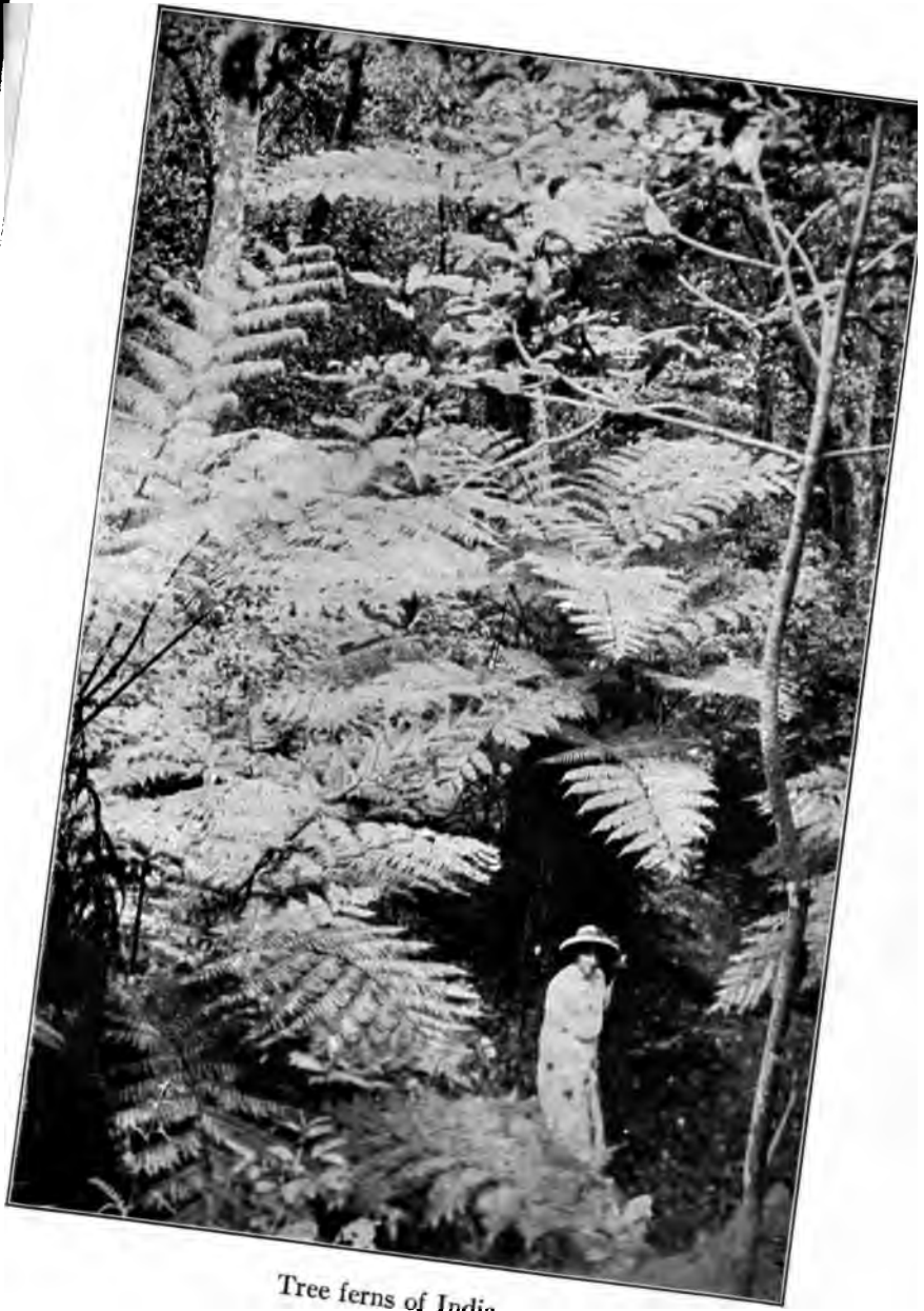
Tree ferns of India