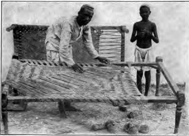
String bed of India, the common sleeping cot