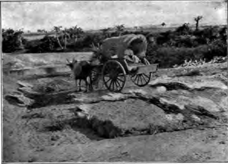
Medak doctor on tour