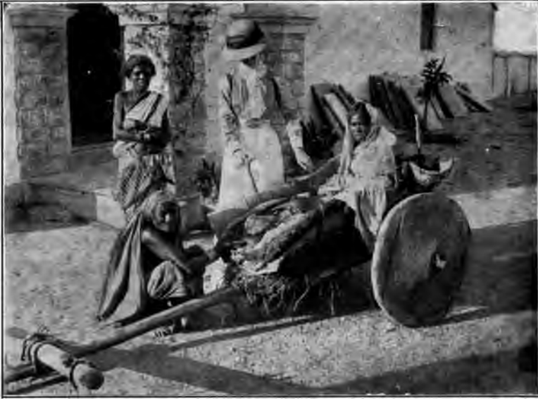
The country cart stopping at Medak Hospital