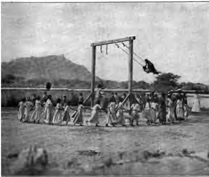
Girls' playground, Medak