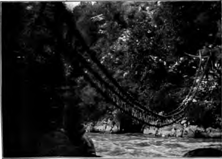
Swing bridge of Kashmir