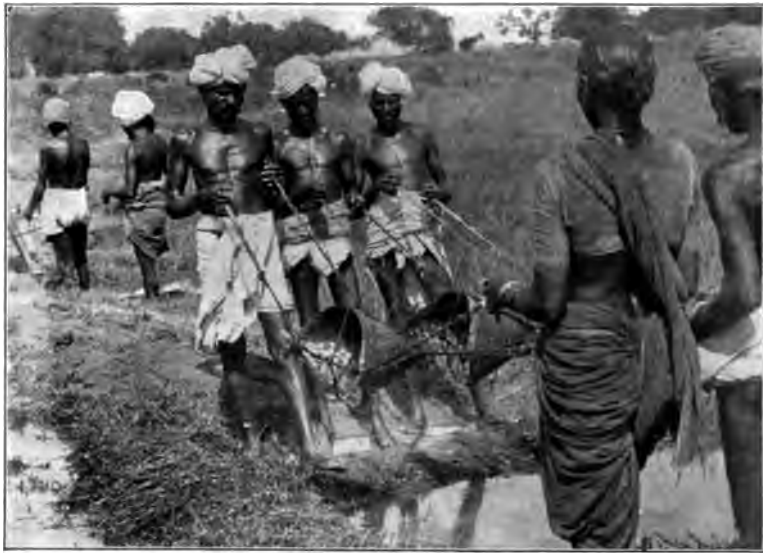
Watering the rice-fields