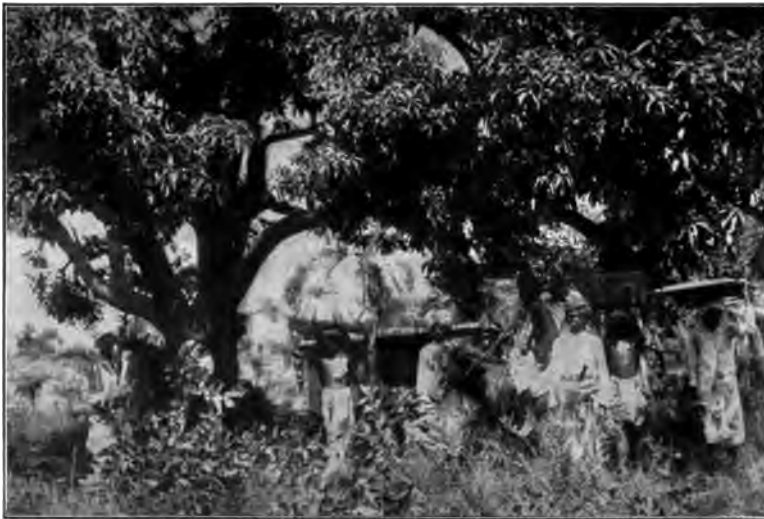
Medak touring outfit