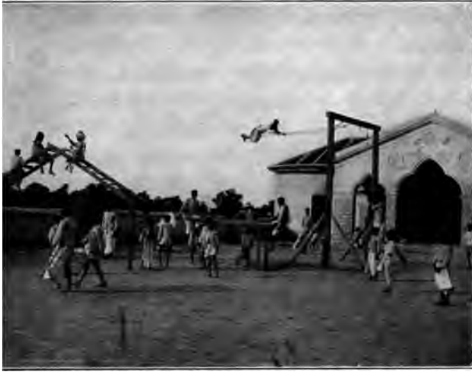
Boys' playground, Medak