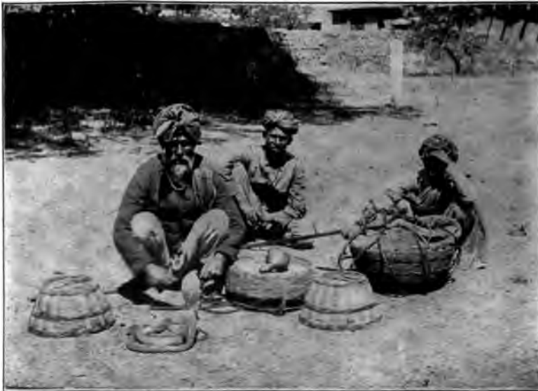
Snake charmers and jugglers