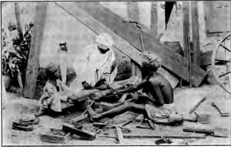
Indian carpenters at work