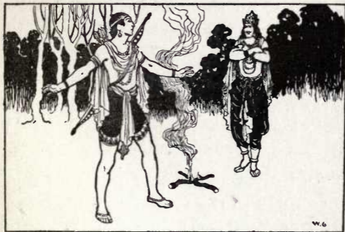
Drona and the Fire of Friendship

And of all Drupada's riches—treasure of gold and emeralds and diamonds and pearls, strings of camels and horses