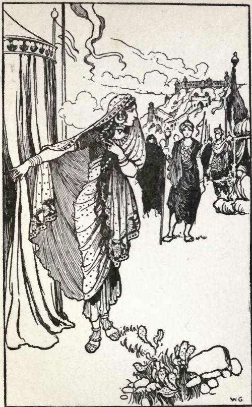
The Lotus-Lady at the prisoner's tent