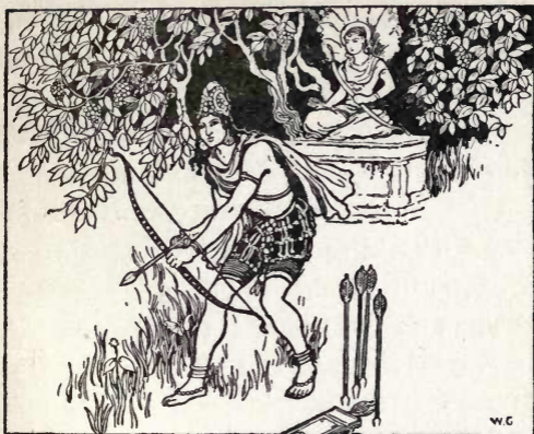
Ekalavya at the shrine

mouth." And they made the dog show them the way to the shrine, and there was Ekalavya shooting ceaselessly.