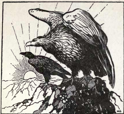
The Eagle Brothers

as children they talked of the wonders of the heavens. And always and always in their talk Little-Eagle San-pati noticed one yearning in the big brother whom he loved and admired.