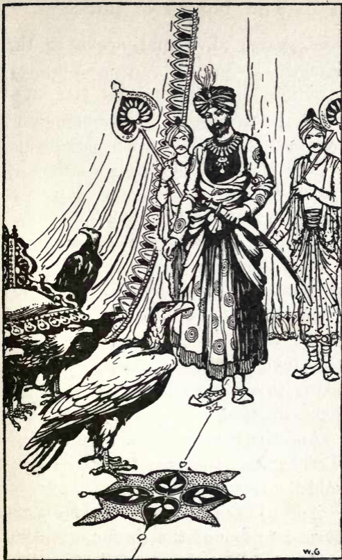
One of the carven eagles came alive