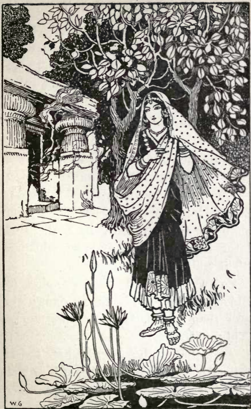
She came to a great house