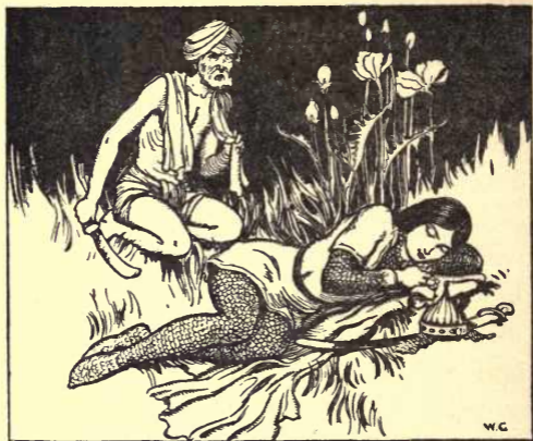
Raziya and the Peasant

And Raziya ruled as few men have ruled in Delhi. She loved justice and mercy, and she gave both to her people. She led them to battle, pitching her own tent in the place of greatest danger: she was generous and wise, and entirely forgetful of her woman's self. All this her people knew of her; and all this historians have said of her.