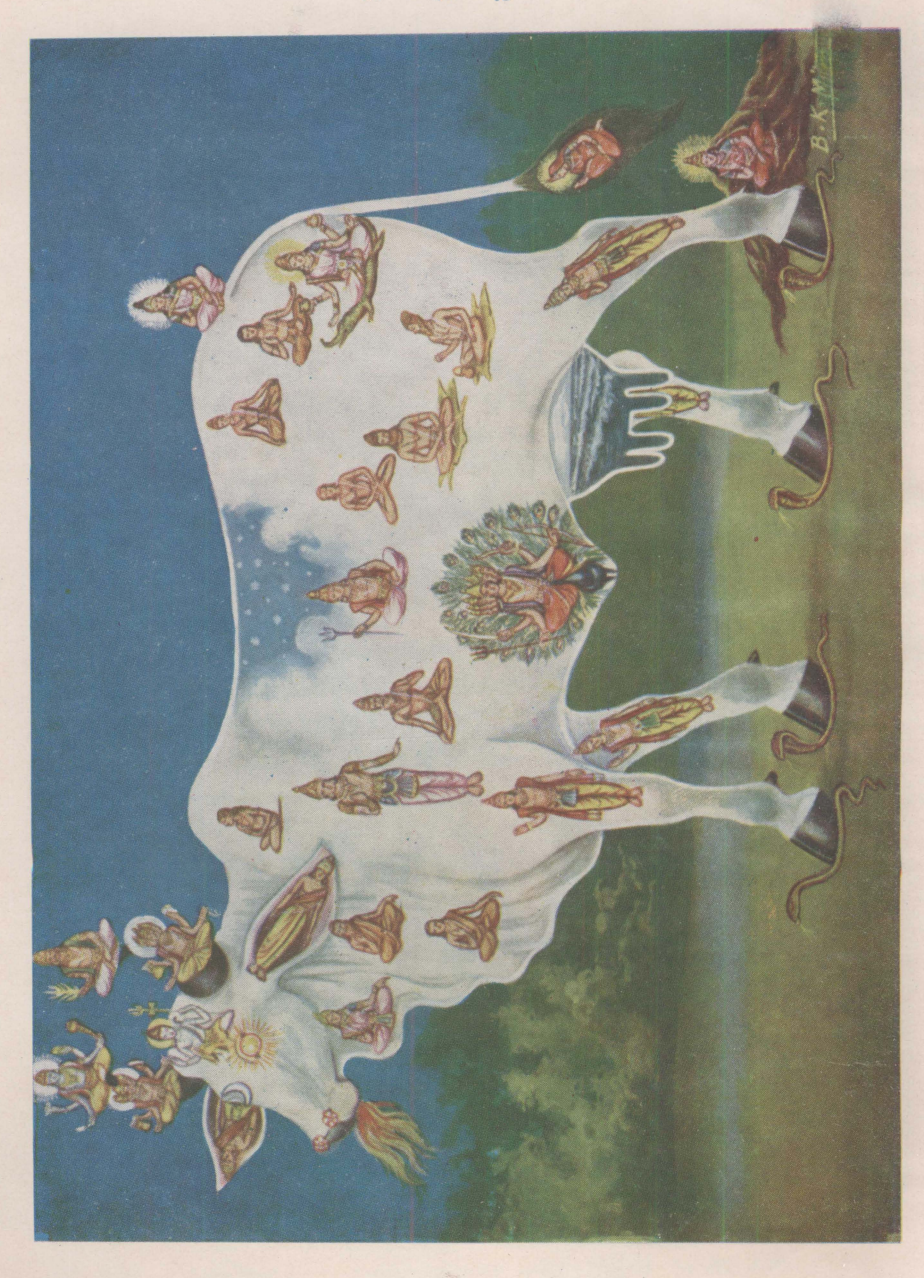
म ज म