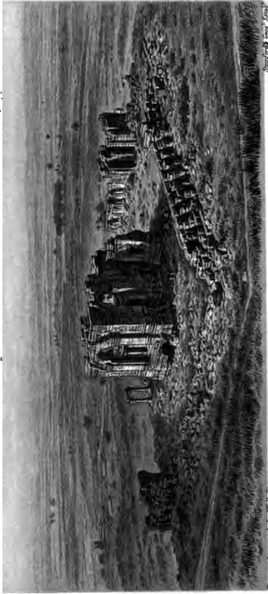
Standard Army Press